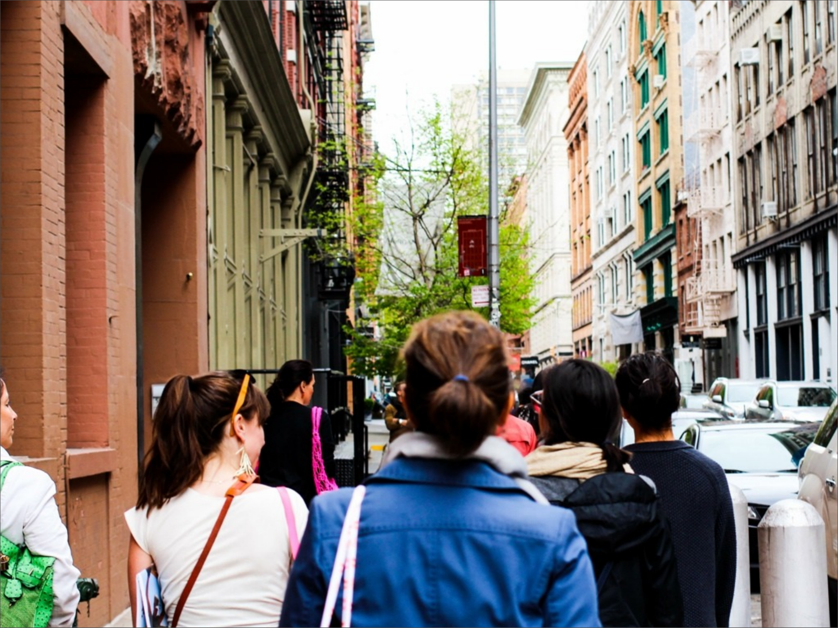
Sunday, January 18, 15