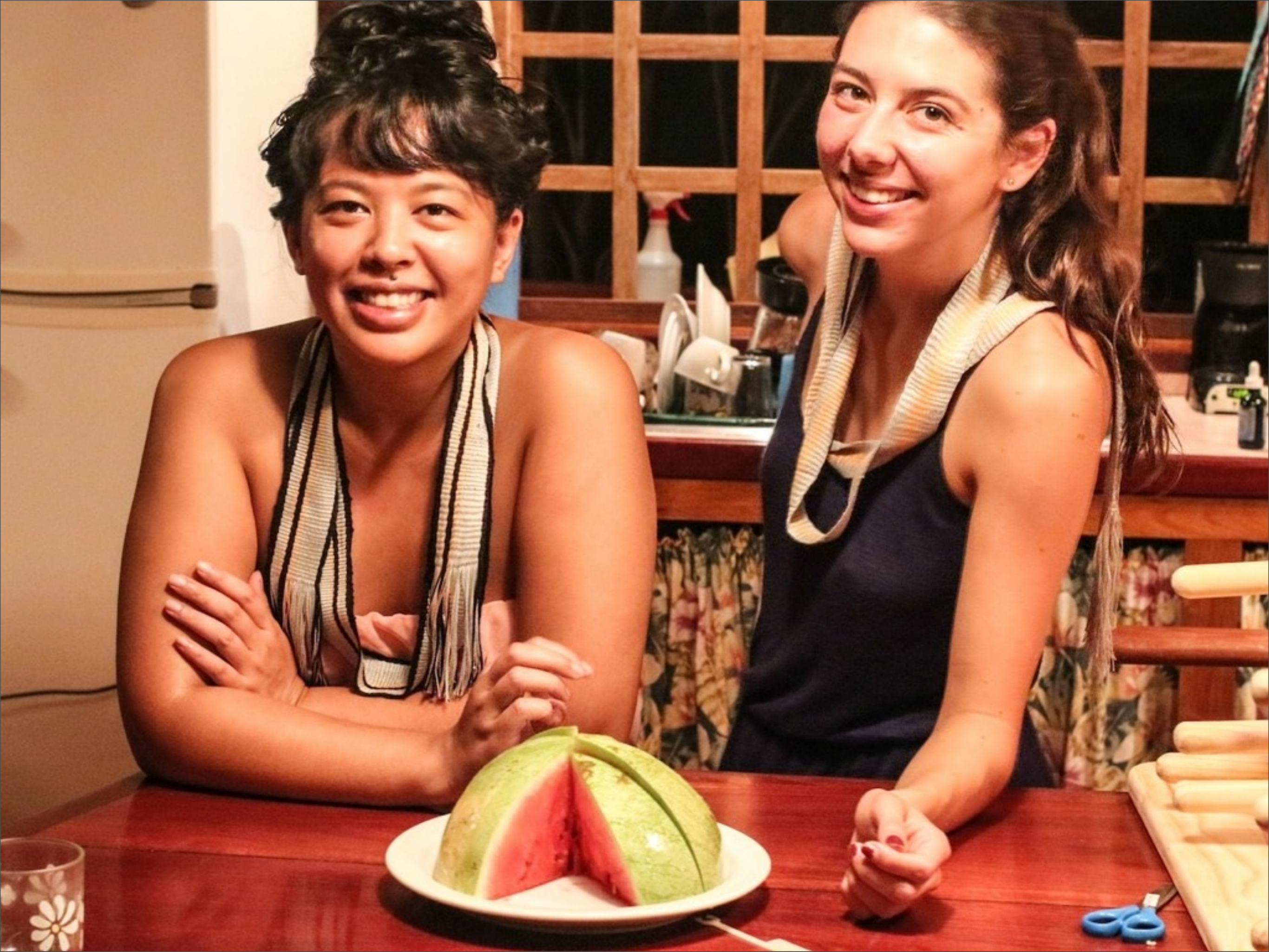
Sunday, January 18, 15